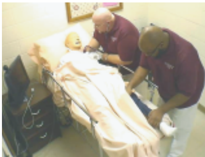
Students working in the Sim Lab. In 2006 the Simulation Lab served 300 students.

Life and Bio Sciences relates to the well-being of the population and those social services provided. It revolves around healthcare using direct patient services and research to improve the quality of life for all generations, as well as activities which support healthcare. Life Sciences incorporates findings from research into the organization and processes of the body into the exploration and innovation of procedures and new methods of caring for patients.