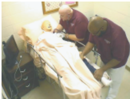
Students working in the Sim Lab. In 2006 the Simulation Lab served 300 students.

Life and Bio Sciences relates to the well-being of the population and those social services provided. It revolves around healthcare using direct patient services and research to improve the quality of life for all generations, as well as activities which support healthcare. Life Sciences incorporates findings from research into the organization and processes of the body into the exploration and innovation of procedures and new methods of caring for patients.